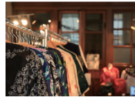
General Goods and Accessories ⑩ Kurochiku Co., Ltd. Museum Store TEL:075-212-4506

More information on shops and restaurants available here→