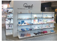
Museum Shop ① Ququ TEL:080-7078-7222