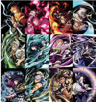
© Koyoharu Gotouge/ SHUEISHA, Aniplex, ufotable

The anime, “Demon Slayer: Kimetsu no Yaiba” has swept the entire world and set a Japanese movie box office sales record milestone in 2020. As the part three of the “Total Concentration Exhibition” series, this exhibition focuses on the “Swordsmith Village Arc” and “Hashira Training Arc”. Looking back at these two chapters through movie images and exhibited materials, the exhibition provides an opportunity for audiences to experience the work’s contents.