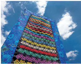
Chikappu Mieko "Hurebenna/Rainbow Song" Private Collection

The sphere of life for the Ainu people was centered in Hokkaido and expanded to Sakhalin and the Kuril Islands within which they developed their unique culture through trading and exchange. This exhibition features a variety of items, including their decorative clothing and accessories, mattings, and ceremonial swords and quivers crafted from a combination of materials such as wood, metal, and deer horns. The exhibition also showcases colorful and brilliant works by contemporary artists.