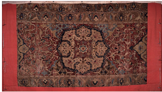
Back hanging of Niwatorihoko (Indian pattern woven carpet with Middle Eastern floral motif medallion), Late 17th C. Collection of the public interest incorporated foundation, Niwatorihoko Preservation Society

An exhibition showcasing the history and culture of the Yamahoko Junko parade, which takes place during the Gion Festival, which adorns Kyoto's summer.