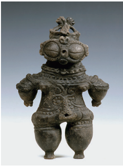
Important Cultural Asset, Shakoki Dogu ("goggle-eyed" clay figure) Possessed by the Agency of Cultural Affairs (Stored in Iwate Prefectural Museum)

The “Jomon Prehistoric Sites in Northern Japan” were registered as a World Cultural Heritage Site in 2021. The area contains numerous Jomon-period ruins, including designated Special Historic Sites such as the Sannai Maruyama Site and the Oyu Stone Circles. This exhibition explores the rich life and spirituality of the Jomon people in relation to their world-renowned culture and sustainable society, which flourished for over ten thousand years in an abundant natural environment, with a focus on excavated dogu clay figures and accessories.