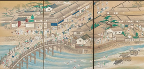
Folding Screen with a Painting of People Enjoying the Cool of the Evening by the Kamogawa River (partial image), Late Edo Period