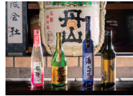
Kyoto's local sake, molted rice, and amazake ③ Kyotanzan Sake TEL:075-255-6165