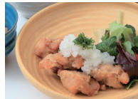
Café, Restaurant and Candy Shop ⑤ Tonimaru Bunkaku Store TEL:075-221-8101