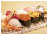
Japanese Restaurant ④ Sushishin IN THE MUSEUM TEL:075-741-7874