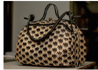
Bags ⑨ onomasato info@onomasato.com