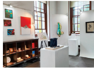
Gallery ⑧ JARFO KYO-BUNPAKU TEL:075-222-0302