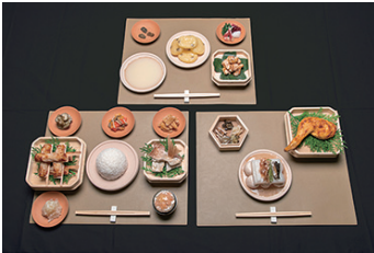
Reproduction Model of Ashikaga Shogun's Meal Collection of the Museum of Kyoto

An exhibition to showcase Washoku, or Japanese cuisine, which has been attracting worldwide attention since its registration as a UNESCO Intangible Cultural Heritage in 2013, examining it from multidimensional perspectives, including scientific and historical elements, along with a wide variety of samples and materials.