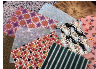
Culture of Japanese paper ② Kyoto Rakushikan TEL:075-251-0078