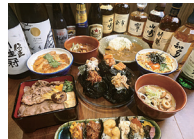
Dining, Onigiri, and Izakaya ⑥ Shigechan TEL:075-585-4261