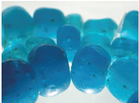
Glass beads excavated from Sasaka Burial Mounds Tango Local History Museum

An excellent world of glasswork flourished during the Yayoi period in the Tango region, now part of northern Kyoto Prefecture. This exhibition introduces the adoration and aesthetic appreciation that ancient people had for the glasswork.