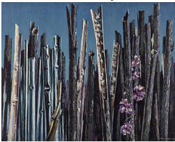
Imai Ken-ichi, "Native Forest", 1938 Collection of Kyoto City Museum of Art

Imai Ken-ichi (1907-1988) was a Western-style painter based in Kyoto. This exhibition showcases the world of Imai's surrealist style, which floats between illusion and reality.